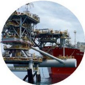
Oil & gas midstream