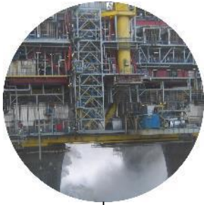
Oil & gas upstream